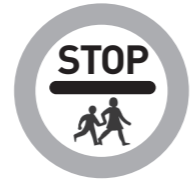
School crossing patrol