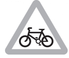
Cycle route ahead