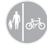
Segregated cycling and pedestrian route