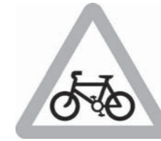
Cycle route ahead